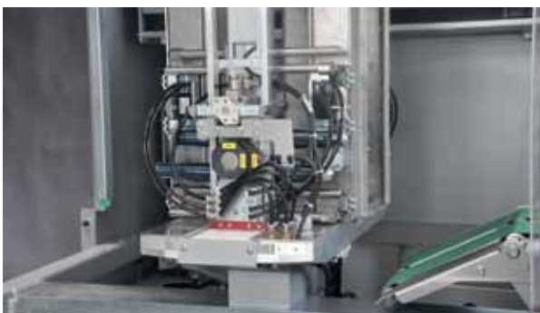
Pivoted delivery belt and optional electrical rotating chamber adjustment