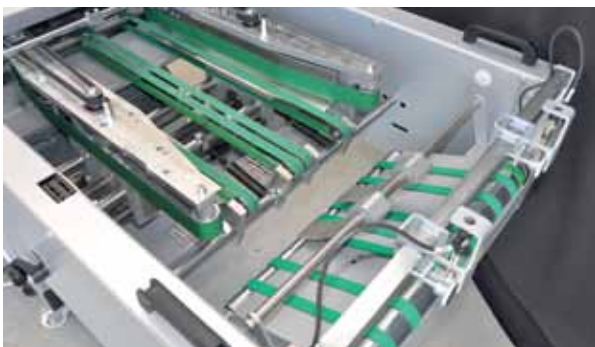
Divert and infeed-jogger