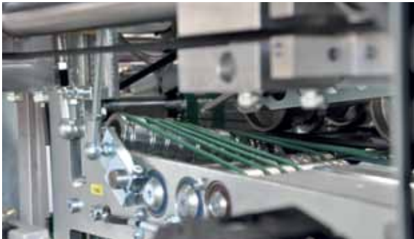
Stabilization of the shingled stream